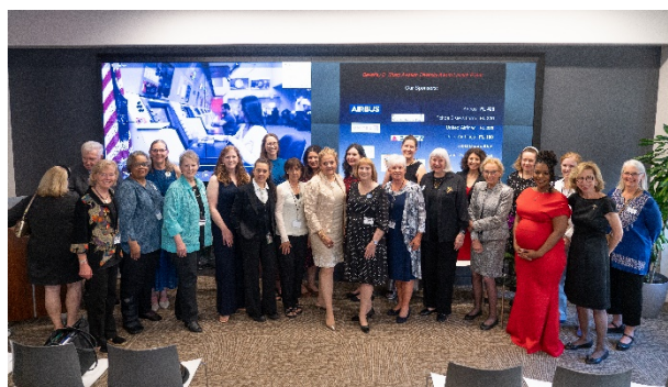
ALL Ninety-Nines in attendance.

There are other photos (however) listing them all will make this document too large to send (it will bounce); I will send a separate link. These are representative of "the best".