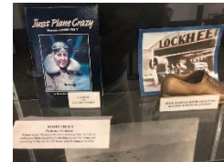
Bobbi Trout "exhibit"

b) Bobbi Trout. Was one of the original legacy Ninety Nines and an accomplished aviatrix. At the Burbank – Bob Hope airport (KBUR). I looked forward to seeing her "exhibit". There is a trophy, one shoe (not even a pair) and a book. We can do better to promote our aviation aviatrix grandmothers. Ideas?