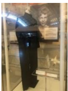
Amelia Earhart "exhibit"

a) Amelia Earhart. We should add to Amelia Earhart artifacts that are presently exhibited at the Smithsonian Air and Space Udvar Hazy Museum. There are too few. Now, we have a 99s button, her hair cutting scissors, a dinner invitation (dinner invitation in her honor). That is very slim pickings, inconsequential and WE CAN DO BETTER ! I provided a draft to the group. Only got a few comments.